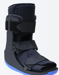
Walker B2 Non-air Short