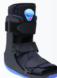
Walker B2 Air Short