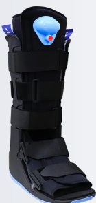
Walker B2 Air Tall