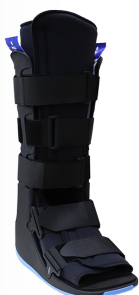
Walker B2 Non-air Tall