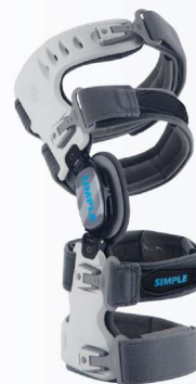
Premium OA Knee Brace S2