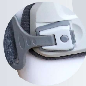
One-Step Closure System