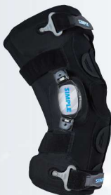
OA Knee Sleeve X1