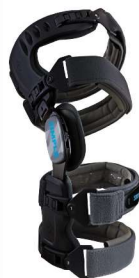
OA Knee Brace S1