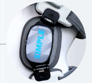
Double Hinge Adjustment