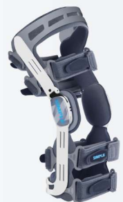
Dual Upright OA Knee Brace M1